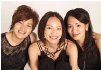
Gracieux Trio